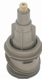
Concealed Inline Cartridge