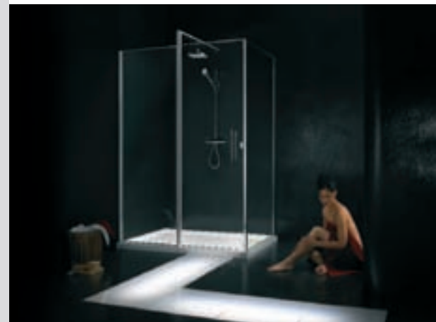
For larger image, see page 08

Prices include Glass Walls, Tray Slab, Columns and Shower Items